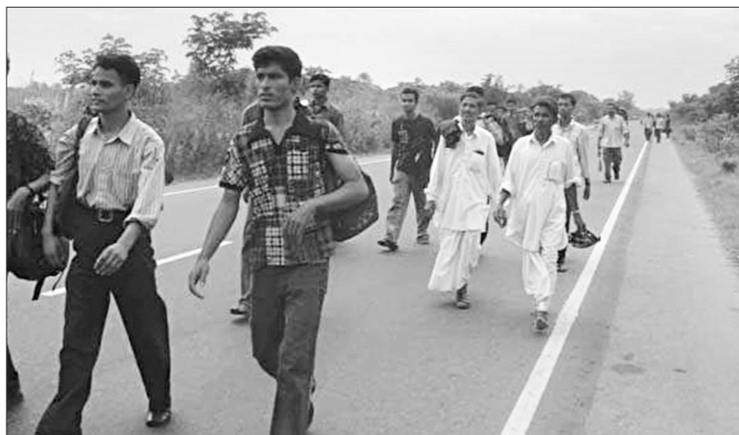
People returning to the capital had to walk long distances on the Dhaka-Mawa highway yesterday as there was no transport due to barricades put up by 14-party activists at many points.