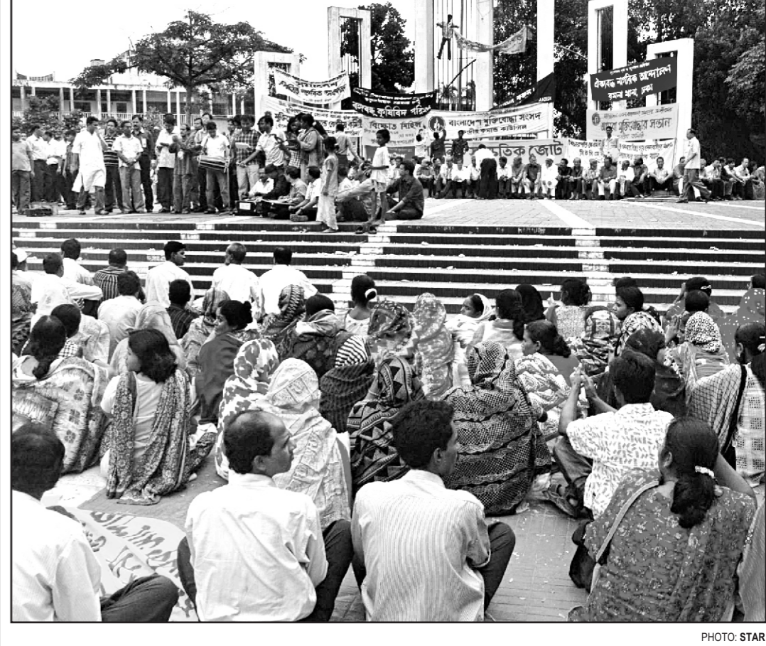
Sammilita Nagorik Andolon, a combine of seven professional and cultural organisations, holds a rally at the Central Shaheed Minar in the city yesterday demanding appointment of an impartial chief of the caretaker government.

Bangladesh Manabdhikar Samannaya Parishad will form a human chain demanding peace and justice. Venue: Panthapath intersection. Time: 11:00am.