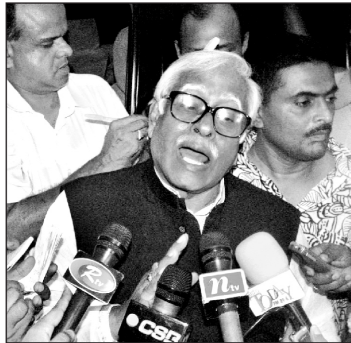
Awami League General Secretary Abdul Jalil, right, and BNP Secretary General Abdul Mannan Bhuiyan, left, talk to journalists after emerging from a meeting with President Iajuddin Ahmed at Bangabhaban yesterday.