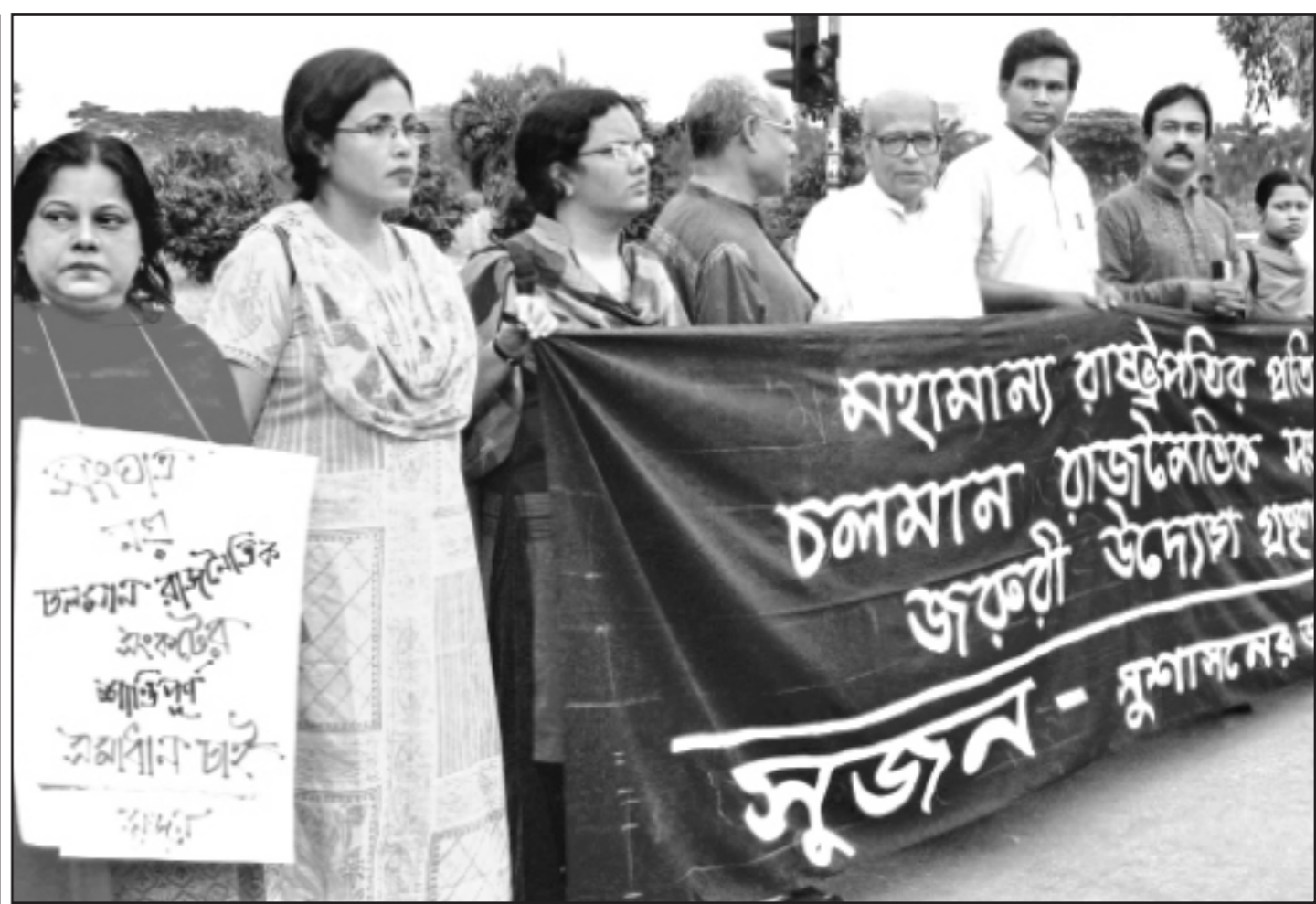
Shushashoner Jonney Nagorik (Shujan) forms a human chain at Manik Mia Avenue in the city yesterday demanding immediate peaceful solution to the current political stalemate.

UNB, Chuadanga A man died and another got injured when a bomb, which they were allegedly making, exploded in a village about 10 miles from the town yesterday.