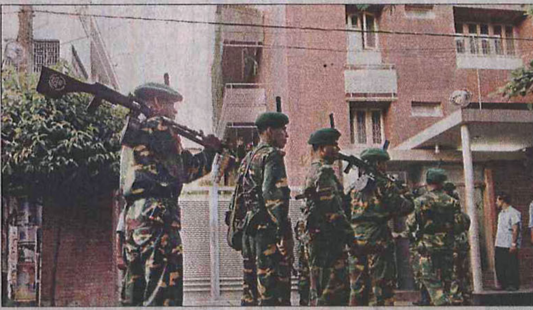
President's Guard Regiment personnel enter Awami League chief Sheikh Hasina's Dhanmondi residence, Shudha Sadan, as part of special security measures for her ahead of the government changeover yesterday.

helm of the caretaker government by extending the retirement age of Supreme Court judges, the collapse of the dialogue between the AL and BNP over the question of Hasan becoming the chief adviser and the AL's subsequent determination to resist any election under the former chief justice exposed the fragile democratic facade under which the political parties operate. The BNP and its alliance have weakened much in the past five years because of unbridled corruption, mismanagement and mishandling of key issues including power situation and prices of essentials and the AL has come SEE PAGE 2 COL 4