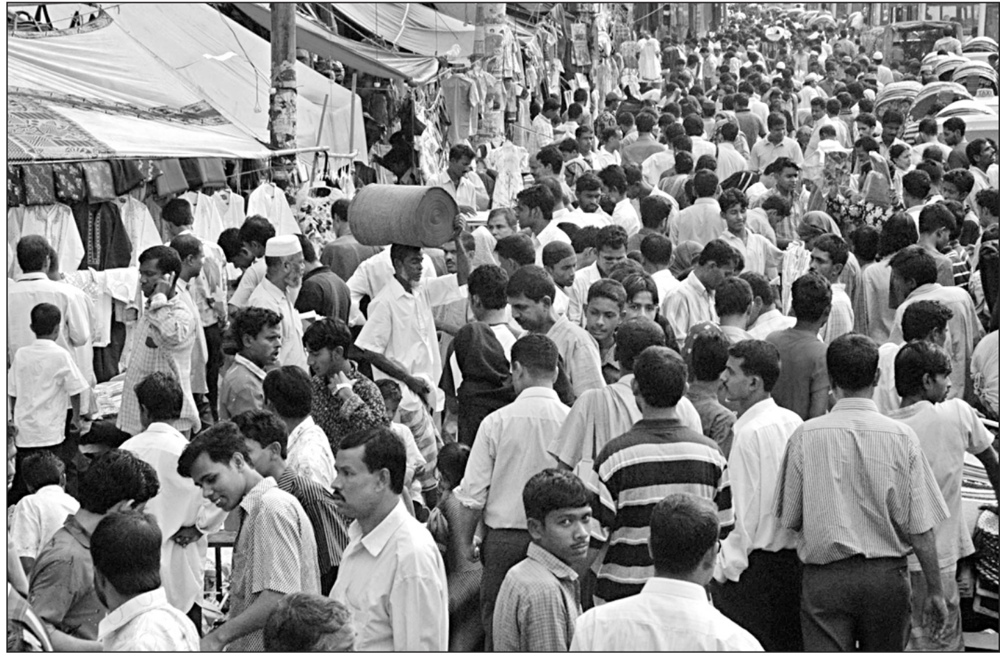
With Eid drawing nearer, people through the makeshift shops on footpaths for shopping at the eleventh hour. The picture was taken from Bangabazar yesterday.