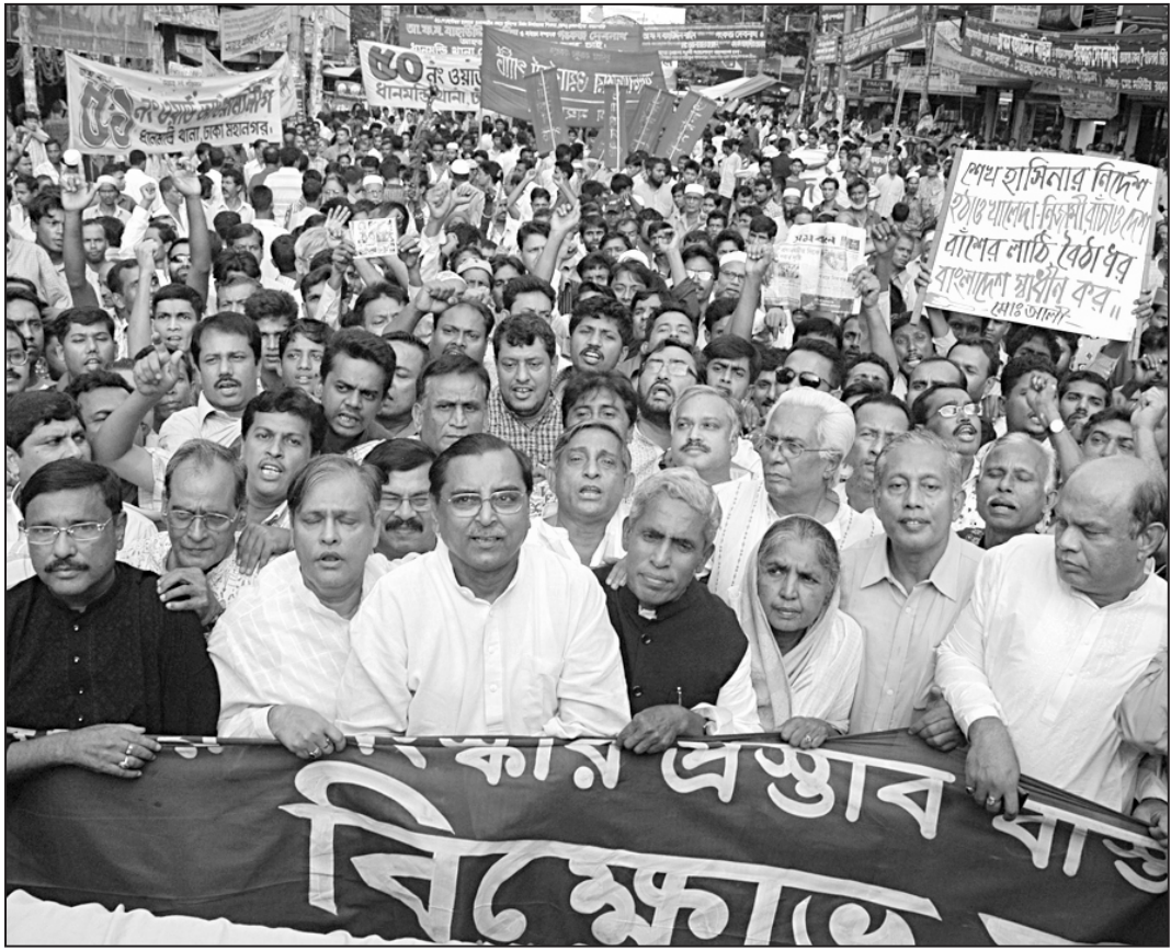
Awami League led 14-party opposition combine stages a demonstration at Bangabandhu Avenue in the city yesterday demanding reforms in caretaker government system and Election Commission.

Similarly, whenever they receive any information from Food Drug Administration or World Health Organisation, they disseminate it.