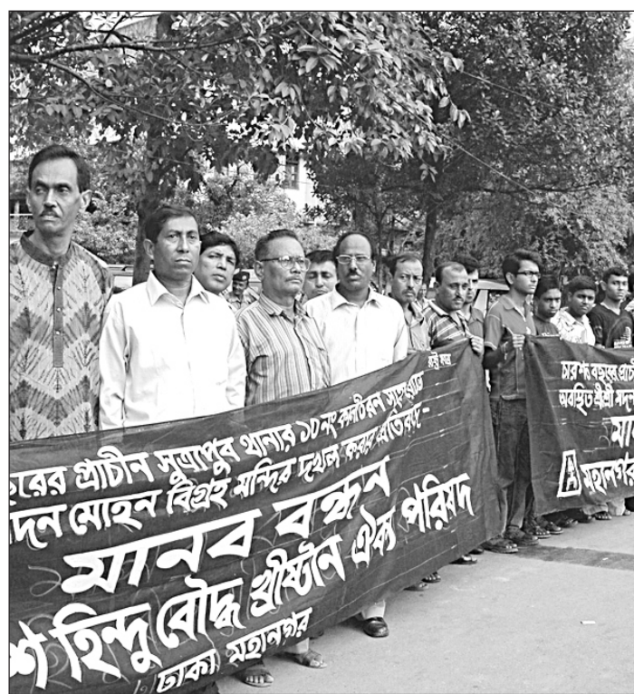
Bangladesh Hindu Buddhist Christian Oikya Parishad forms a human chain at Muktagangan in the city yesterday protesting the move to occupy Madan Mohan Bigraha Mandir in the old part of Dhaka.