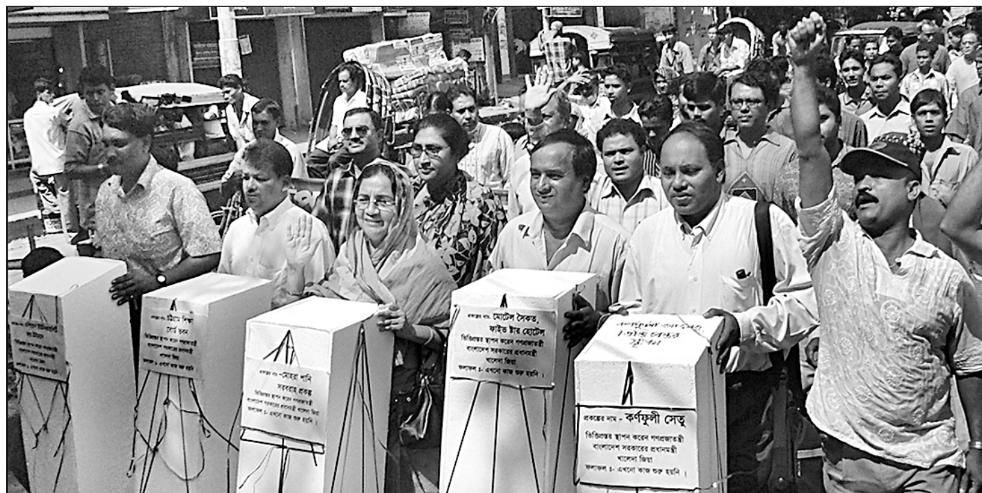
Residents of Chittagong take out a protest procession yesterday with symbolic foundation stones of five major projects laid by the alliance government in the port city.