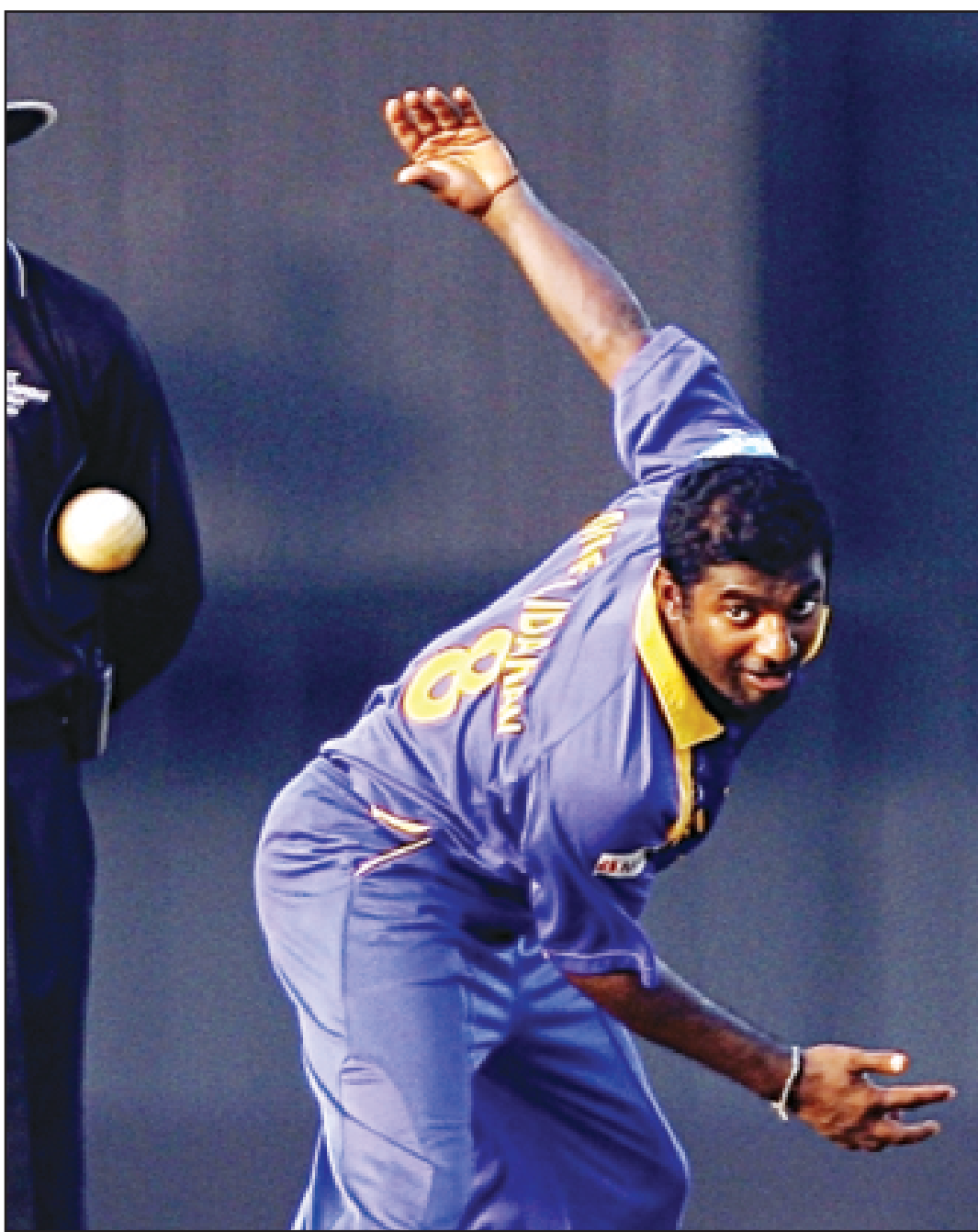
Sri Lankan legendary spinner Muthiah Muralidaran delivers the ball during the ICC Champions Trophy match against New Zealand in Mumbai on Friday.