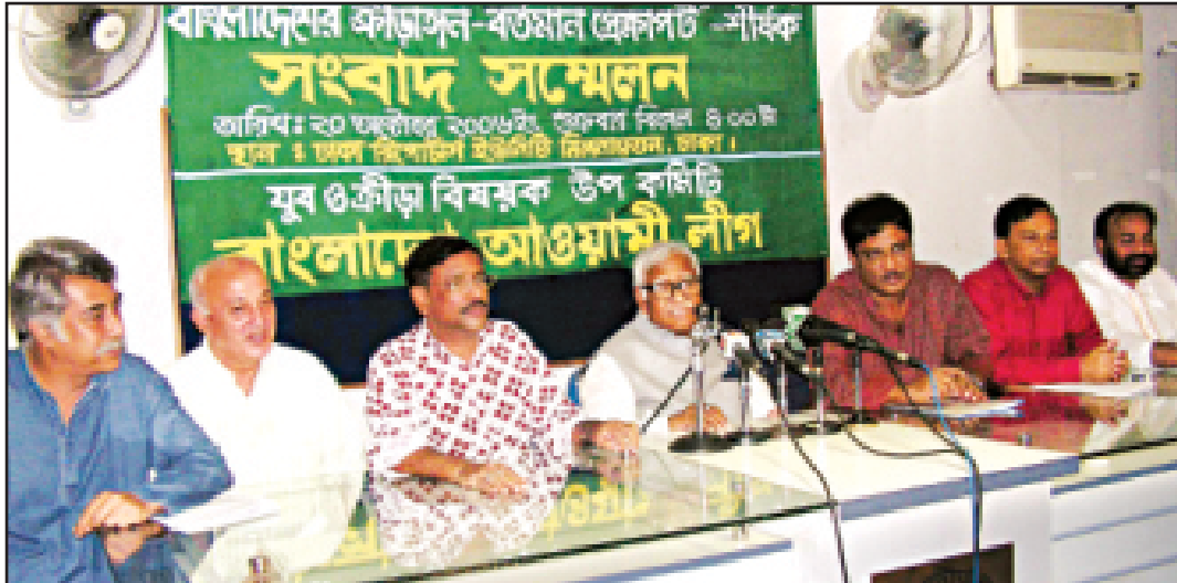
Awami League general secretary Abdul Jalil addresses a press conference organised by the Youth and Sports sub-committee of the party at the Dhaka Reporters Unity auditorium yesterday.

also tarnished the face of sports with undemocratic activities," accused Kader. "The sports federations have been run mostly by their own party members as they replaced elected bodies with ad-hoc committees led by their party members. As a result of this, the Bangladesh Football Federation was banned by FIFA, which is one of the darkest chapters in our sports history. SEE PAGE 18 COL 2