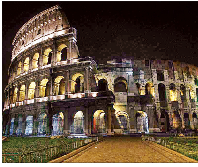
A view of the Colosseum in Rome 2007, in Lisbon. About 20 million votes have already been lodged, including many from India, for the Taj Mahal;

Only one of the ancient wonders of the world still survives -- now history lovers are being invited to choose a new list of seven. Among 21 locations shortlisted for the worldwide vote is Stonehenge, the only British landmark selected. The 5,000-year-old stones on Salisbury Plain, Wiltshire, will be up against sites including the Acropolis in Athens; the Statue of Liberty in New York; and the last remaining original wonder, the Pyramids of Giza in Cairo. An original list of nearly 200 sites nominated by the public was narrowed to 21 by the organizers and experts, including the former director general of UNESCO Professor Federico Mayor. The vote is organised by a non-profit Swiss foundation called 'New7Wonders' which specialises in the preservation, restoration and promotion of monuments, and the results will be announced on July 7,