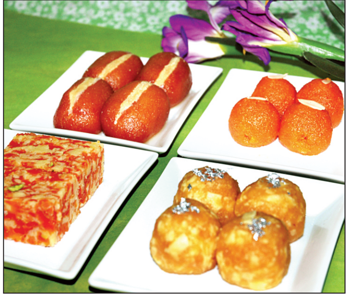
Delectable sweets available at the stores in Dhaka

Sweets occupy an important place in the diet of Bengalis and at their social ceremonies. It is an ancient custom among Hindus to distribute sweets at pujas and among Muslims to prepare sweets on Shab-e-barat and Eid days. Sweets add a special touch to festivities -- be it marriage, celebrating good results or birth of a child. During Eid days guests are entertained with different types of home-made traditional sweets such as laddu , halwa , firni , roshogolla , shemai , zarda and shondesh . Besides these traditional items, some sweets originated in the west like pudding, custard and ice cream are also among the favourites of the urbanites. In addition to homemade sweets and desserts people also buy sweets prepared by mairas , or sweet and dessert makers.