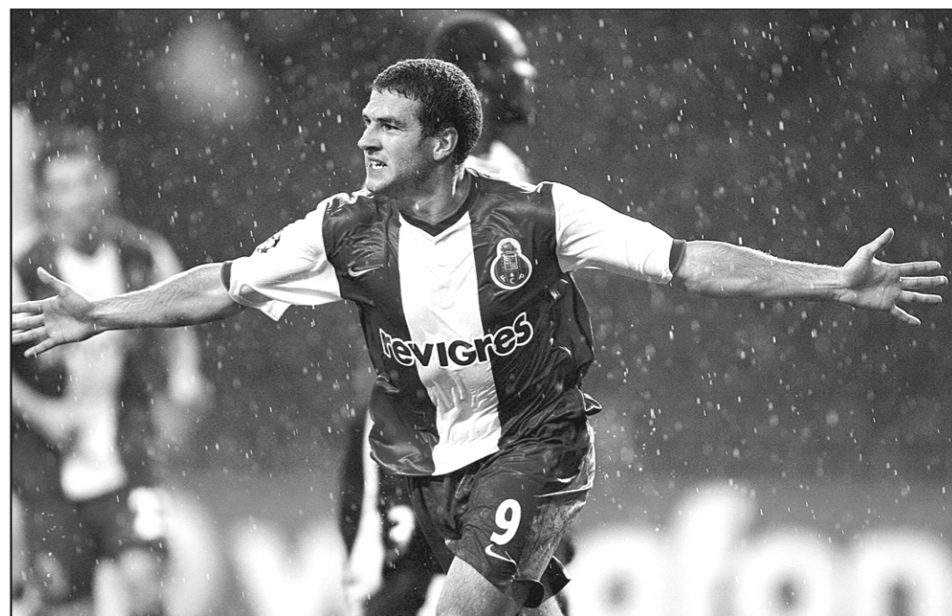
FC Porto forward Lisandro Lopez celebrates after opening the scoring against Hamburg SV in their Champions League clash in Porto on Tuesday.

Postiga capped a fine game with a diving header on 69 minutes to make it 3-0 and Lopez added his second to leave Hamburg players praying for the final whistle.