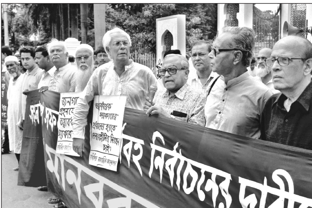
Sammlita Samajik Andolon forms a human chain in front of the High Court in the city yesterday demanding electoral reforms for a free and fair election.