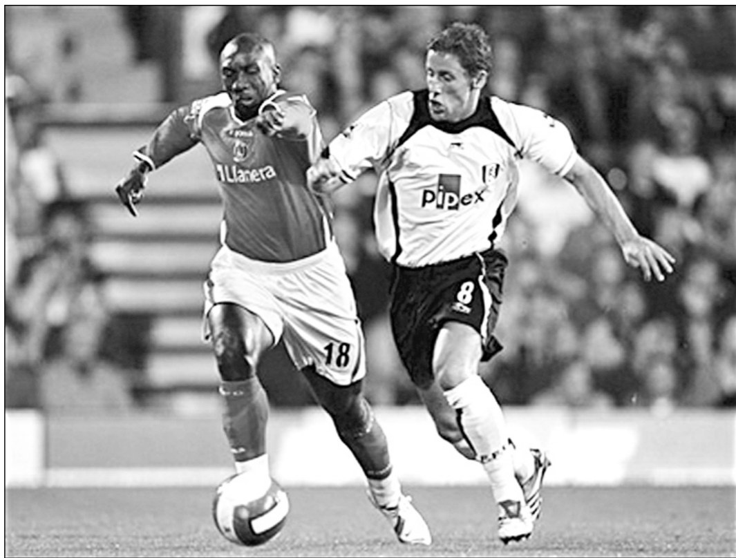
Charlton Athletic striker Jimmy Floyd Hasselbaink (L) shrugs off the challenge of Fulham midfielder Michael Brown in their Premiership clash at Craven Cottage on Monday.

Under-fire Spain coach Luis Aragonese on Monday got the dreaded vote of confidence from the national football federation despite his team having lost two of their opening three Group F Euro qualifiers.