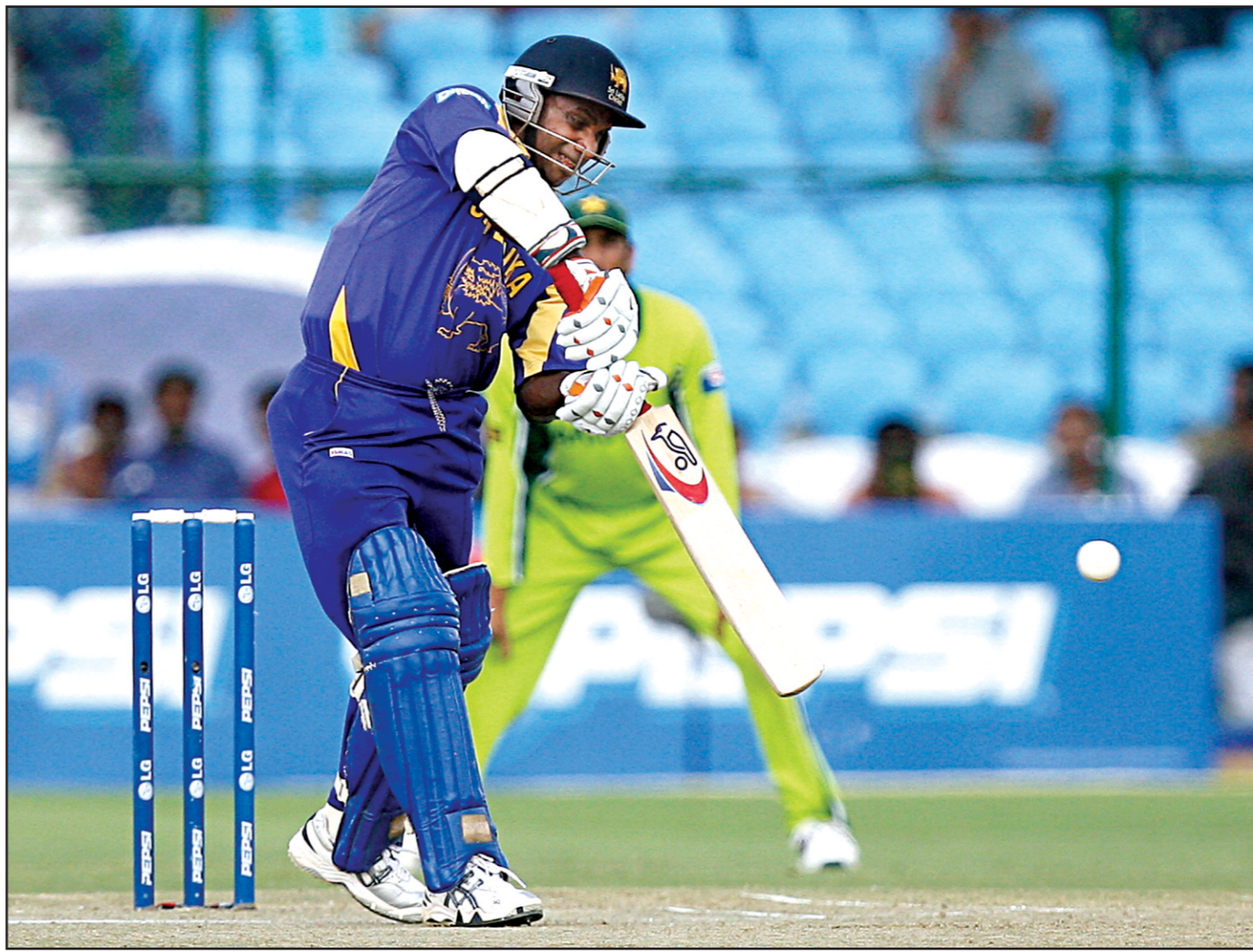
Sri Lanka opener Sanath Jayasuriya plays a cover drive during an ICC Champions Trophy match against Pakistan at the Sawai Mansingh Stadium in Jaipur on Tuesday.