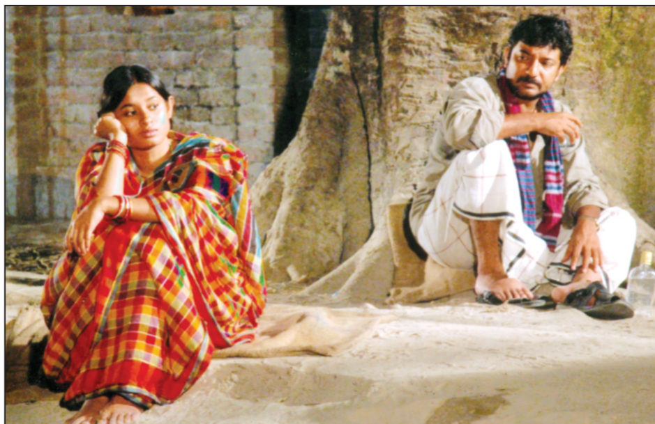
A scene from Rupkathar Galpo set to release on Eid