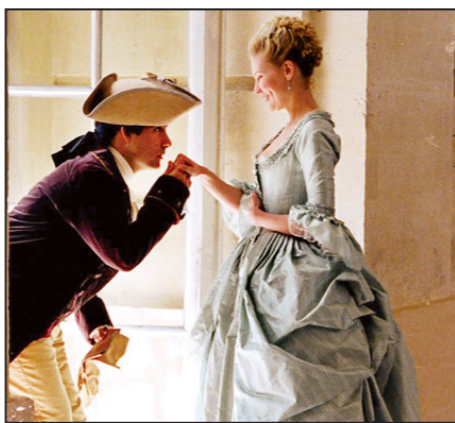
Jason Schwartzman and Kirsten Dunst in Marie Antoinette

Marie finds the existence of the rich and royal, in pre-Revolutionary France, to be starved beyond all tolerance; over time, she exerts a softening, not to say trivialising, influence, and that, in turn, is one of the factors that hasten the Revolution's rush.