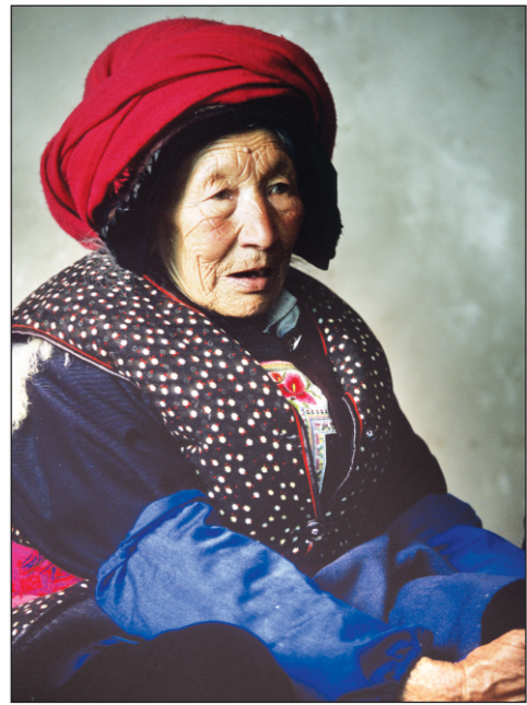
A photograph by Then Chih Wey of Singapore

Some of the leading photographers will be conducting workshops in the course of the festival.