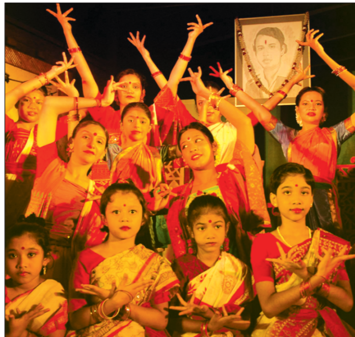
Young performers of Drupad Kala Kendra at the event