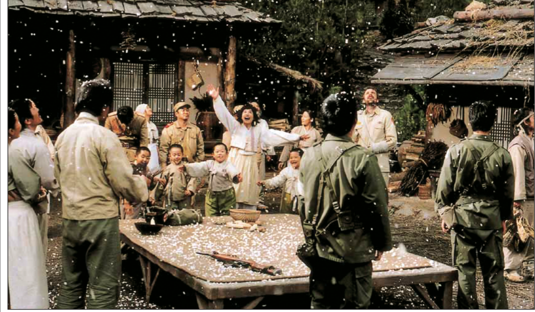
A scene from Welcome to Dongmakgol

The festival will end with the 2006 Korean Cup Taekwondo Tournament. Taekwondo is a 2,000-year-old martial art for self-defence, focusing on the development and discipline of both body and mind. About 30 million people practice this sport in more than 140 countries now. The tournament will be organised by Bangladesh Taekwondo Federation. The tournament will be held in Uttara Club on November 10.