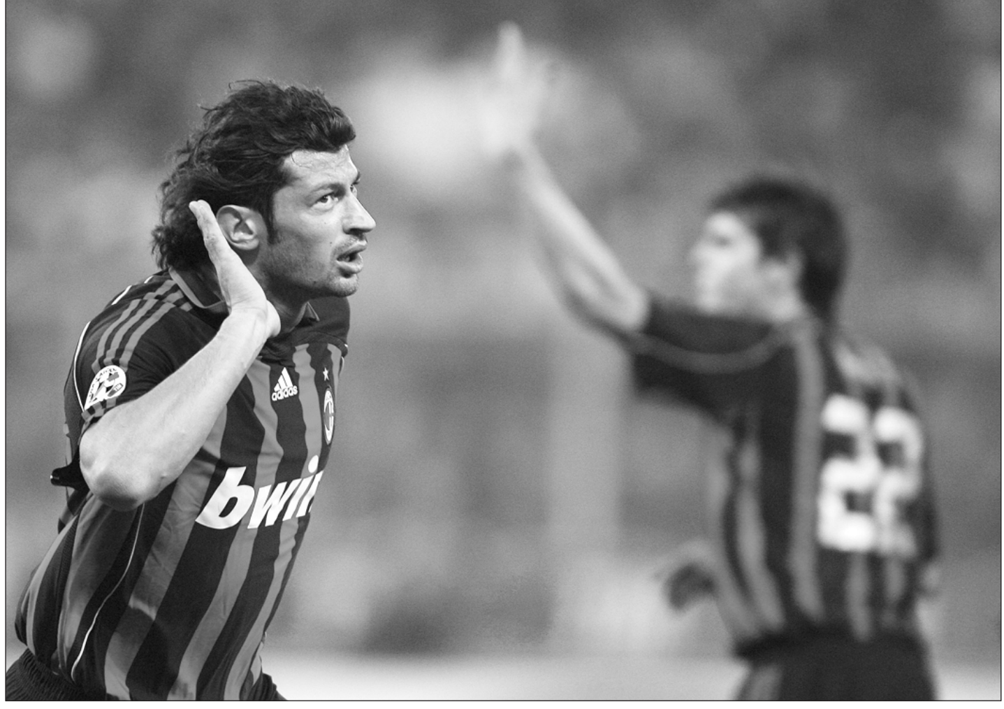
AC Milan defender Kakha Kaladze (L) celebrates his equaliser against Sampdoria during their Serie A match at Luigi Ferraris Stadium in Genoa on Saturday.

Ribery joined Marseille in the summer of 2005 from Turkish outfit Galatasaray and has four years left to run of his contract at the Velodrome.