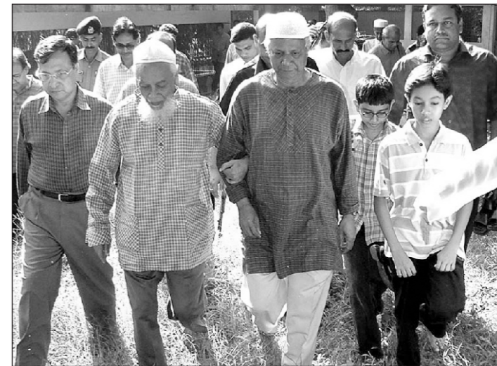
(Clockwise) Nobel laureate Prof Muhammad Yunus surrounded by jubilant people at his native Jobra village, with emotion charged former Chittagong University, approaching his father's grave at Miskin Shah Mazar graveyard and offering fateha at his mother's grave at Jamtala in Kapashgola in the port city yesterday.