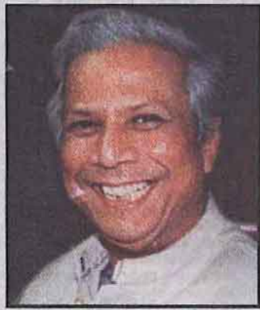
Dr. Muhammad Yunus and Grameen Bank