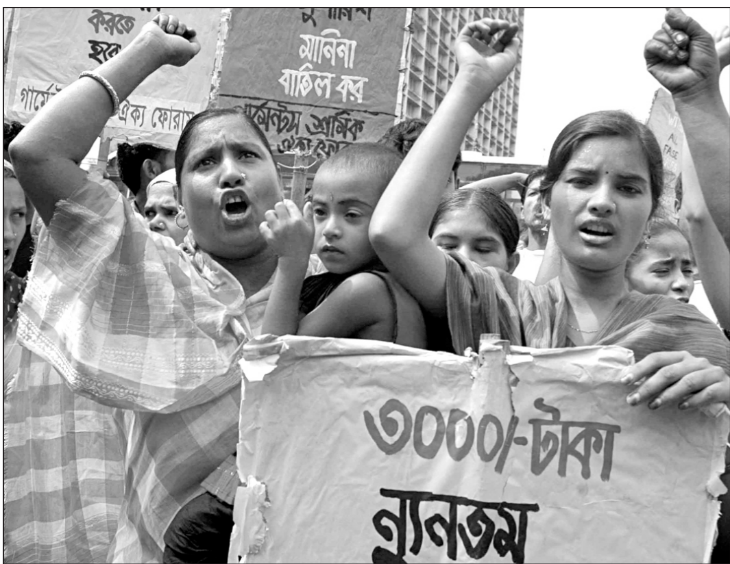
Garments Sramik Oikya Forum stages a demonstration in the city yesterday demanding a minimum wage of Tk 3,000.

of different owners were also reduced to ashes in the fire that originated from electric short-circuits, sources said.