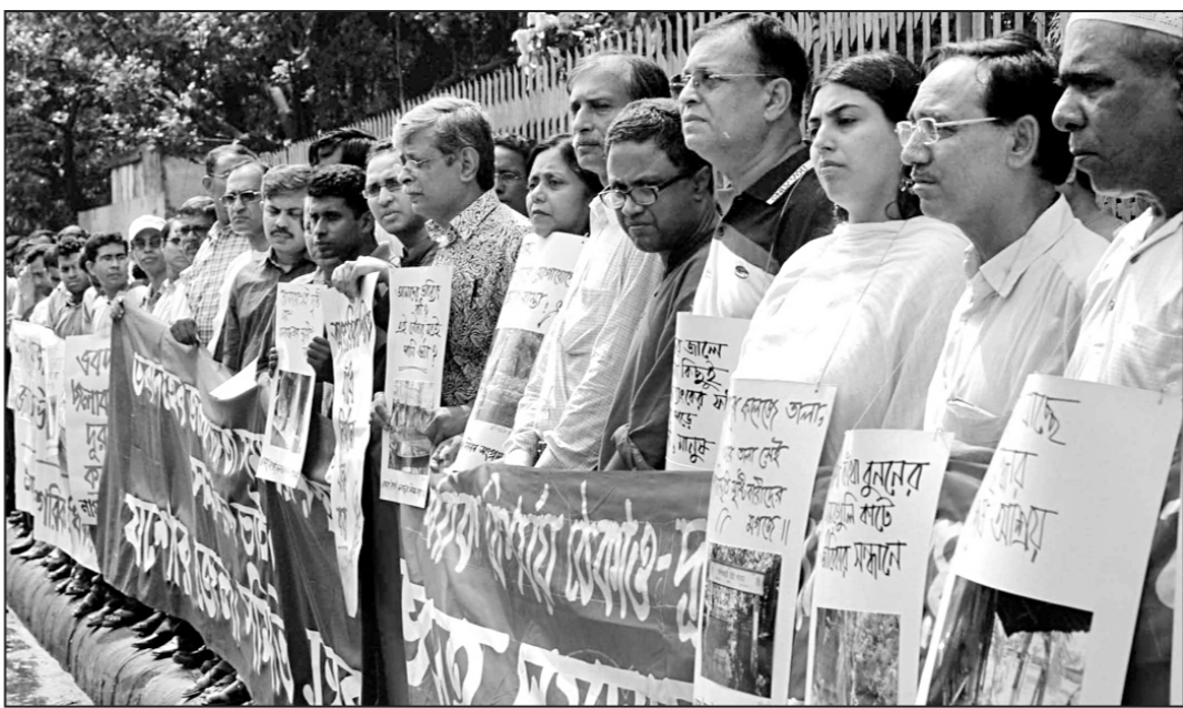
Nagorik Sanghati forms a human chain in front of the Fine Arts Institute at Shahbagh in the city yesterday demanding immediate steps to resolve waterlogging problems at Bhabadaha in Jessore.

One person was killed and 25 people, including a LGED engineer, were injured, when an underconstruction bridge on Bonarpara-Nakaihat road in Saghata upazila collapsed on Thursday.