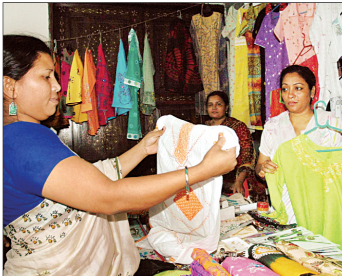
A fair-goer checking out the collection, a handmade doll (R)