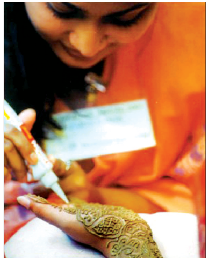
A young woman getting henna designs on her palm (top)

registration of the colour of henna, the greater are the expectations of happiness in the marriage.