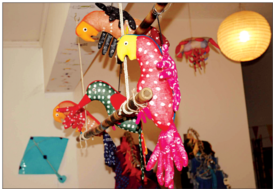
Gift items available at different stores in the city

Meanwhile at Karupalli, a government-owned organisation, Eid sales are picking up.