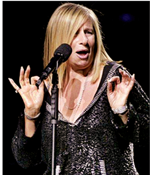
Barbra Streisand performs in New York's Madison Square Garden on October 9