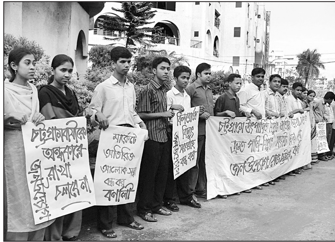
Jano Udjog, a local civic body, formed a human chain in Cheragi Pahar in Chittagong city yesterday protesting frequent loadshedding.

Later, Moulvibazar-Kulaura-Chandgram Bus Owners' Association called a bus strike on the route for an indefinite period.