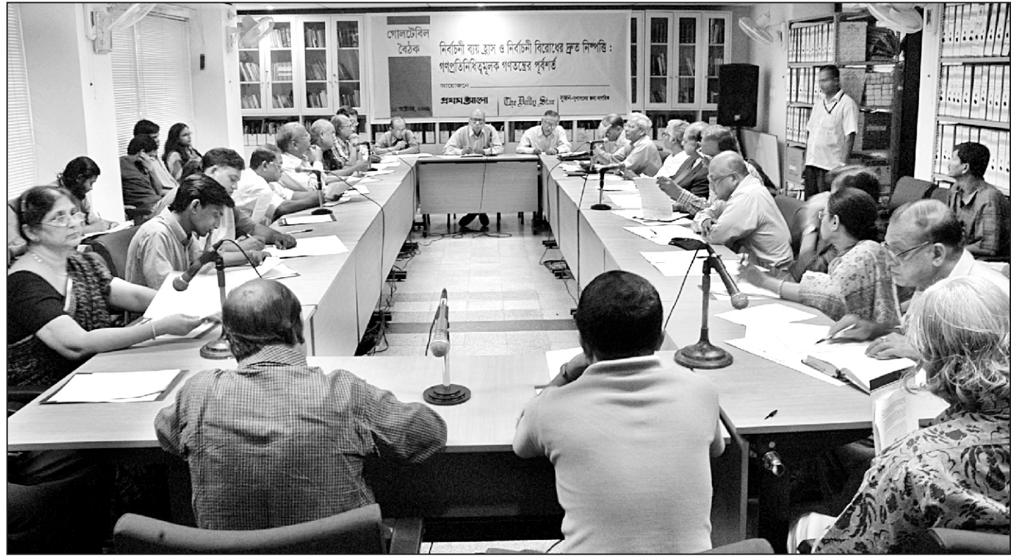
Participants of a roundtable on 'Reduction in election expenditure and quick disposal of election disputes: Essential Prerequisites for representative democracy' held at the conference room of The Daily Star in the city yesterday. Shushashoner Jonno Nagorik (Shujan) in association with the Prothom Alo and The Daily Star organised the roundtable. (Story on page 16)

Ministers and distinguished personalities also attended the darbar.