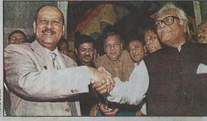
BNP Secretary General Abdul Mannan Bhuiyan, left, and Awami League General Secretary Abdul Jalil shake hands after yesterday's talks on reforms.