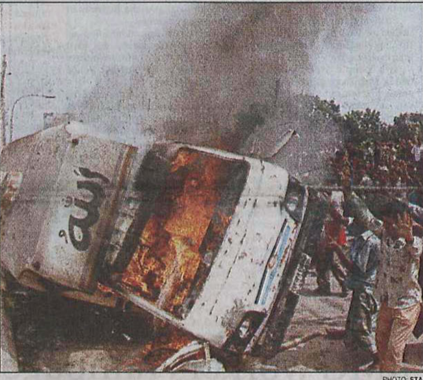
FROM LEFT... Garment workers hurl stones at a shopping arcade in Uttara in the capital during their half-day strike yesterday. A number of workers torch a human haulier at Uttara as at least a hundred others chant slogans for minimum wage of Tk 3,000.