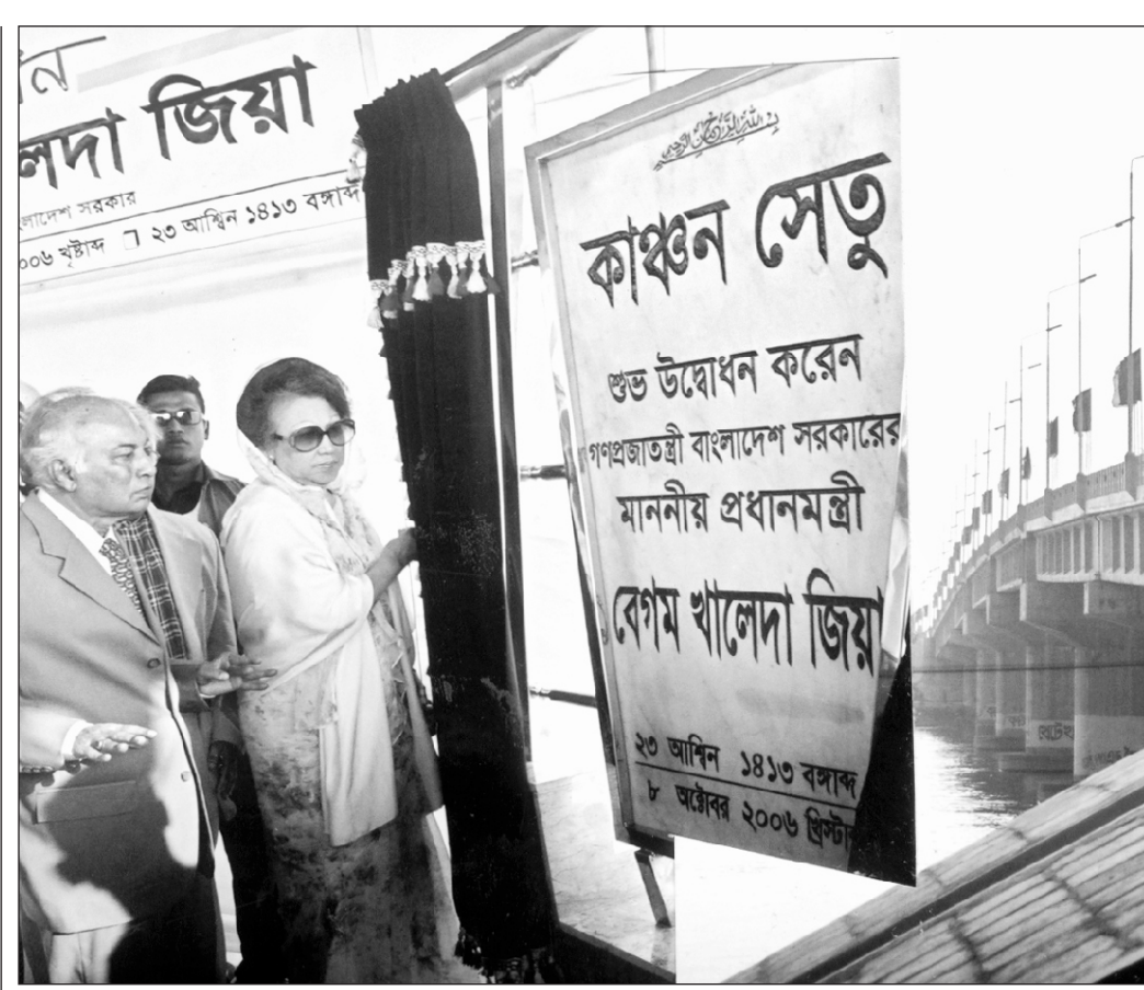
Prime Minister Khaleda Zia inaugurates Kanchan Bridge at Rupganj in Narayanganj yesterday.

The Parishad leaders told The Daily Star last night that if the state minister fails to keep his promises by October 10, they would launch a fresh agitation.