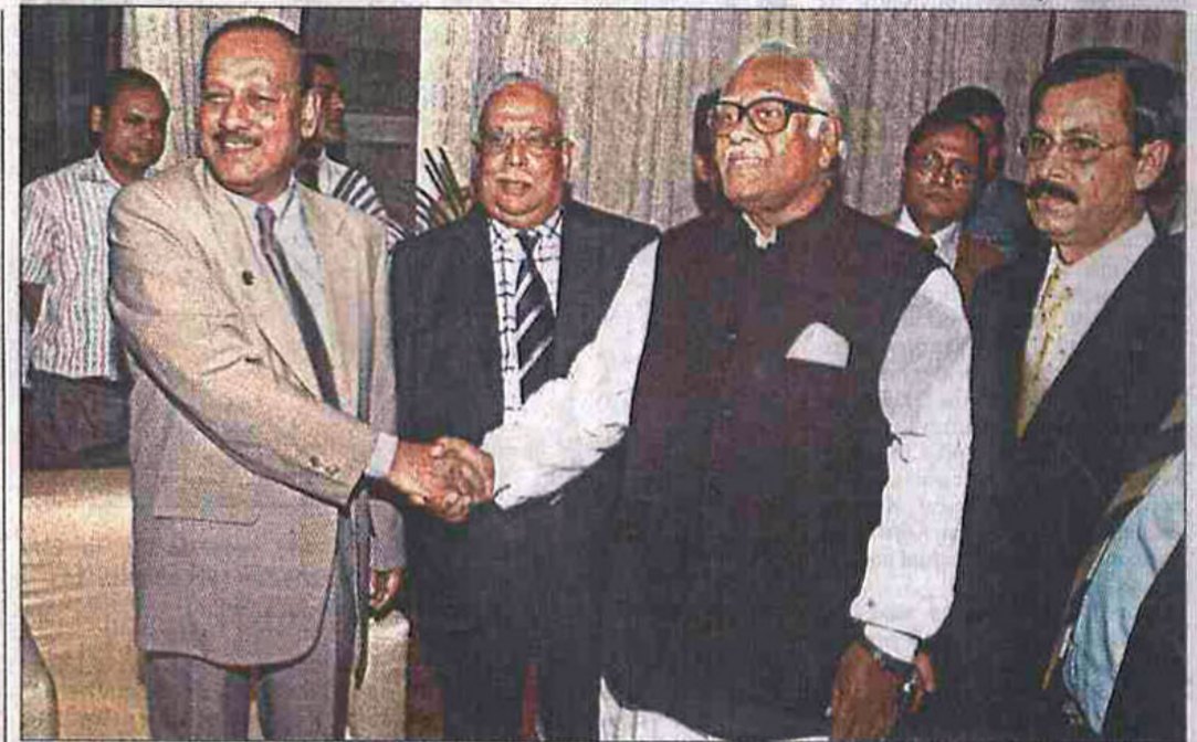
BNP Secretary General Abdul Mannan Bhuiyan, left, shakes hands with Awami League General Secretary Abdul Jalil ahead of the third day's talks on reforms at the Jatiya Sangsad Bhaban yesterday.