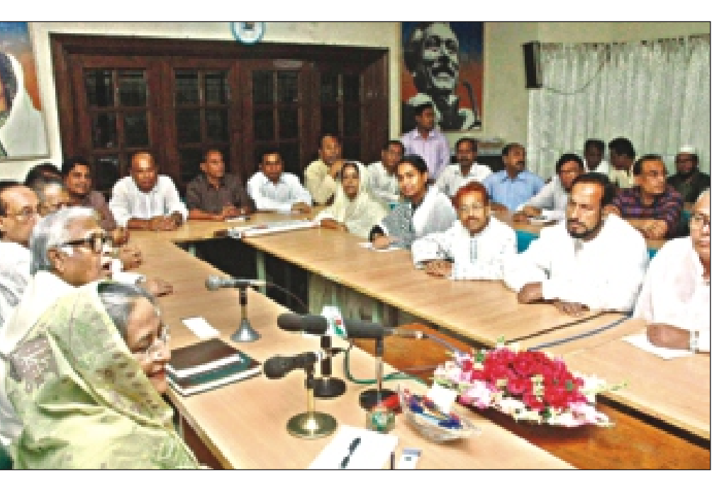
Awami League (AL) leaders are seen at the party's Central Working Committee meeting at its Dhanmondi office in the capital yesterday. The meeting discussed the ongoing BNP-AL dialogue on electoral reforms

The recent cancellation list SEE PAGE 15 COL 3