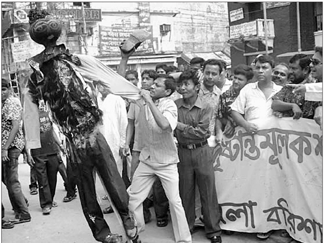
The Bangabandhu Shishu Kishore Mela, after forming a human chain in front of Aswani Kumar Hall in Barisal city yesterday, assaulting an effigy of the director general of Bangladesh Television (BTV) protesting its recent distortion of history of the Liberation War.