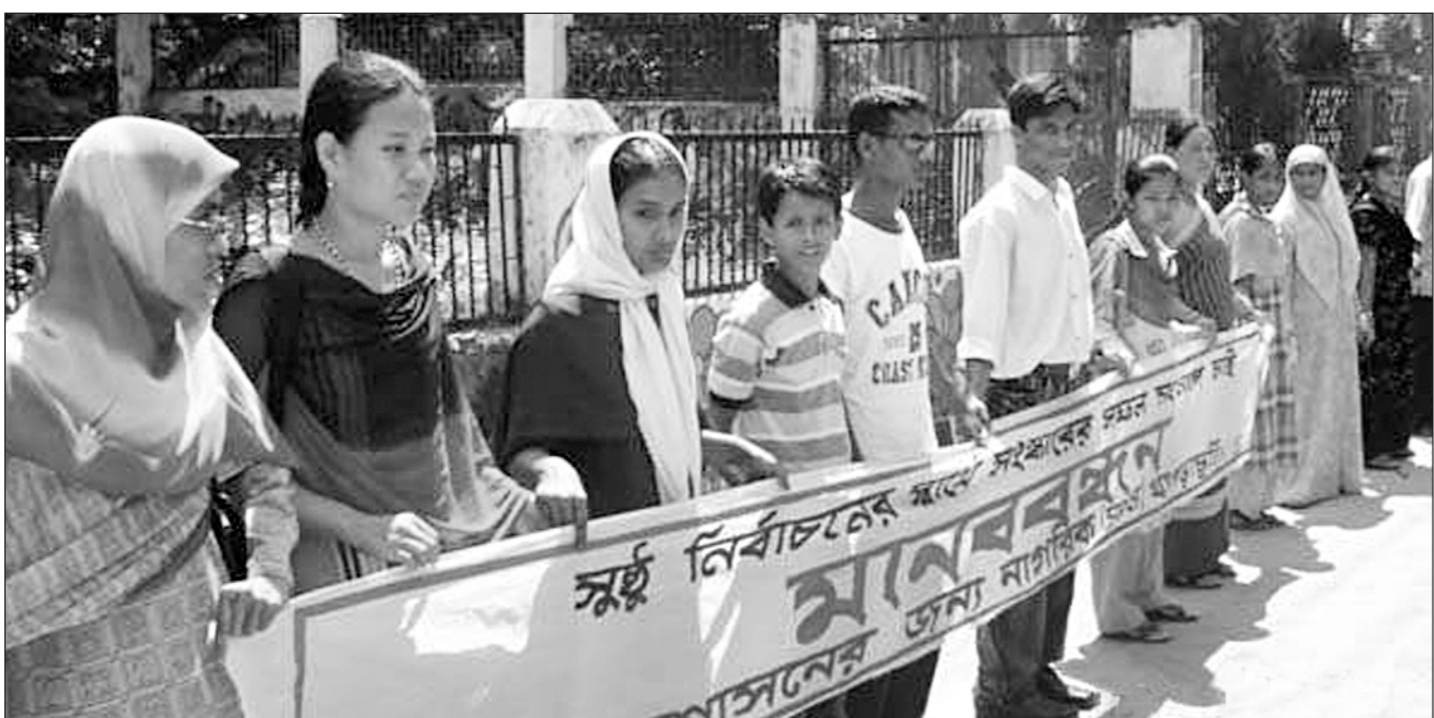
Khagrachhari district unit of Citizens for Good Governance (Sujon), an NGO, formed a human chain in front of Shaheed Minar in the town yesterday with the slogan 'fruitful dialogue needed for fair election'.

The dealers also alleged that LPG was being supplied in larger quantities to some districts, violating official decisions.