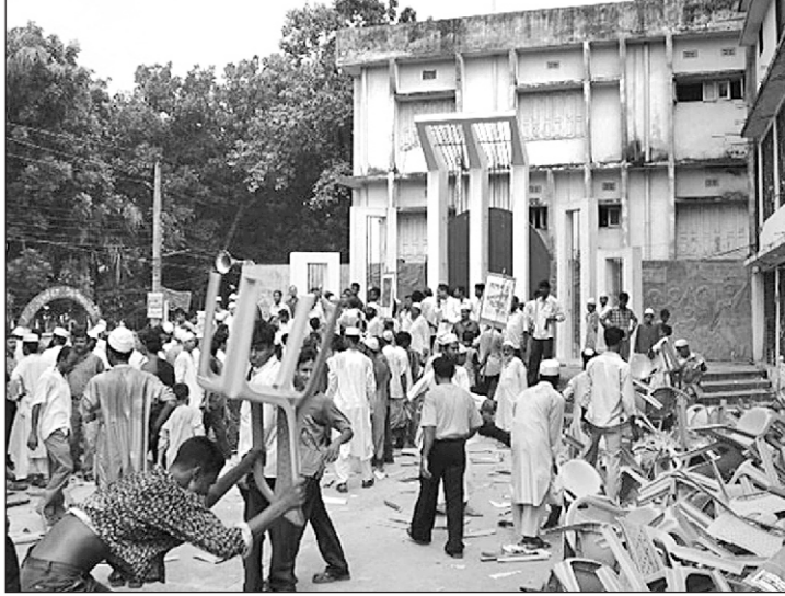
(Clockwise) The procession brought out by the 'brothel eviction committee' proceeding towards the Nagorik Mancha rally on Central Shaheed Minar premises and vandalised it while panicked inmates of Kandapara brothel prepare with sticks to resist the attackers.