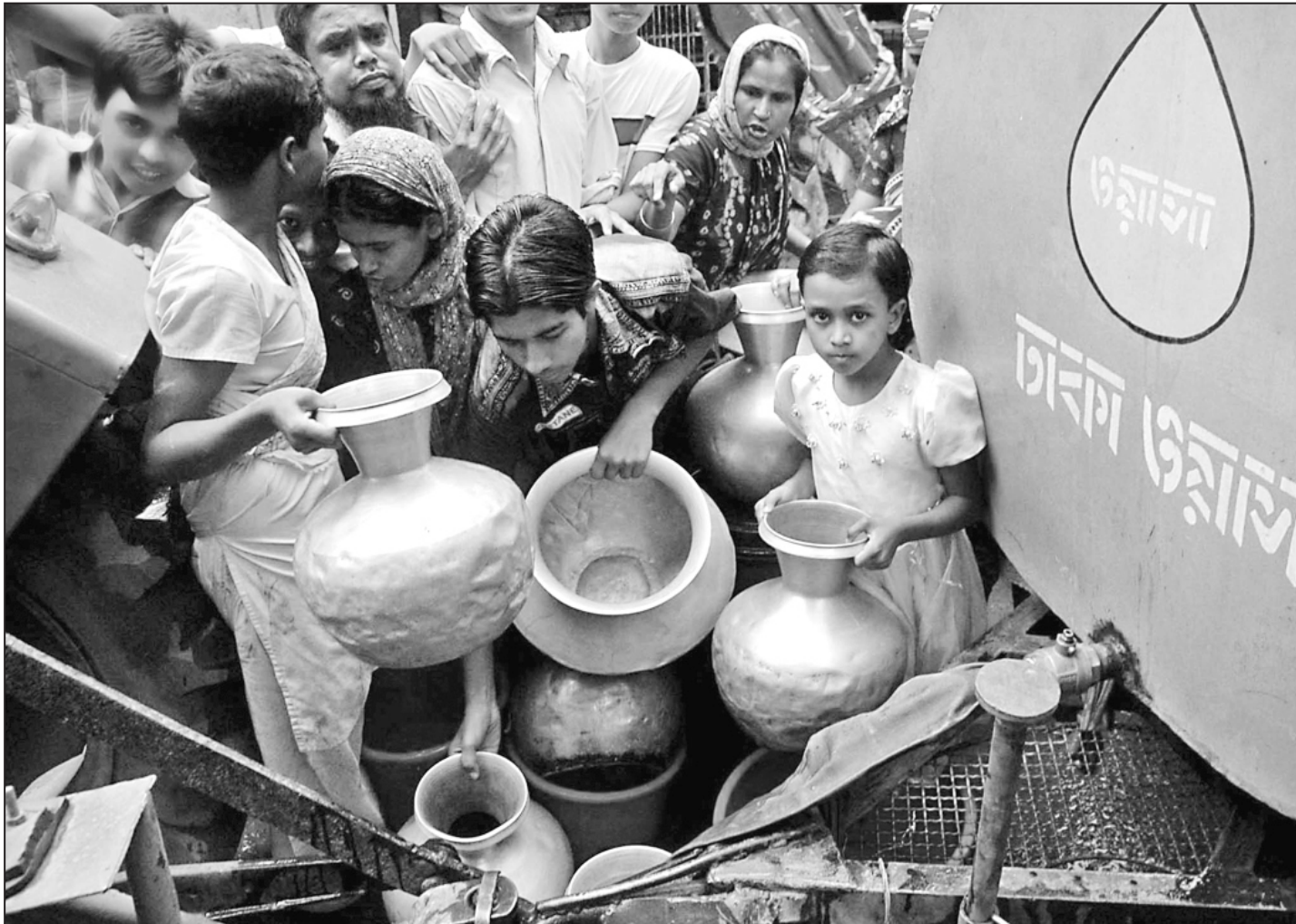
People throng to collect water from WASA tank lorry at Mitail Road in Rayer Bazar in the city yesterday as there is no supply of water for 15 days in the areas.