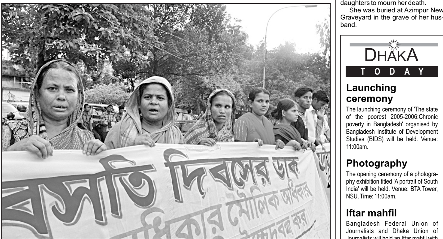
Jatiya Bastohara Jote forms a human chain at Mukhtangan in the city yesterday marking the World Habitat Day.