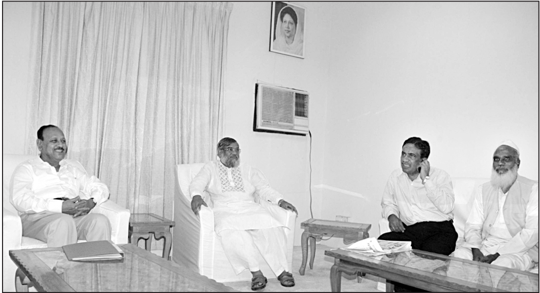
Secretary general level meeting of ruling 4-party alliance was held at Mintu Road in the city yesterday.

Interested persons can contact the organisation at House # 666 (New 28, 1st floor), Road 33 (New 11), Dhanmondi. Phone: 8124453. E-mail: tryfoundation2004@yahoo.com.