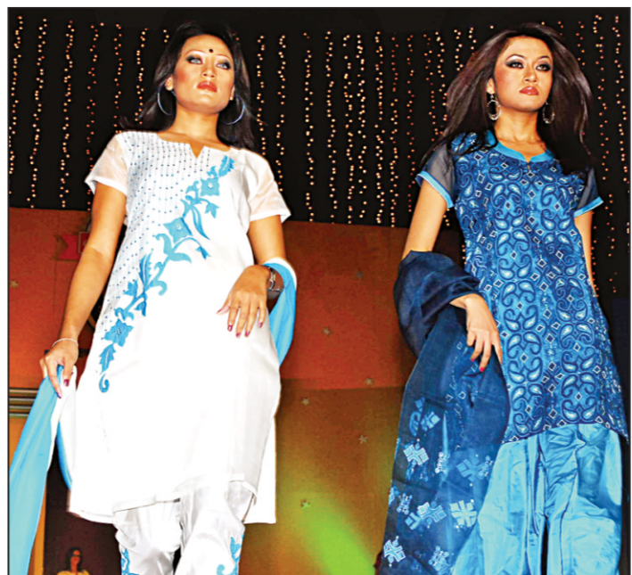
Models display Eid designs at the fashion show

The programme was aired on Channel i yesterday.