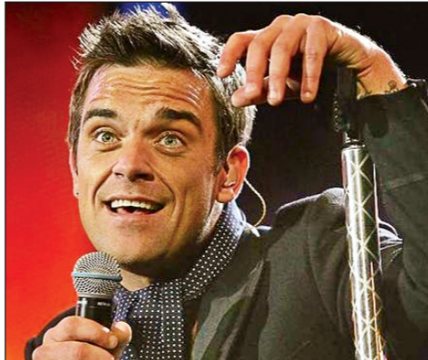
Robbie Williams On Star World at 9:30pm An exhilarating presentation of Robbie Williams' 'Close Encounters' tour.