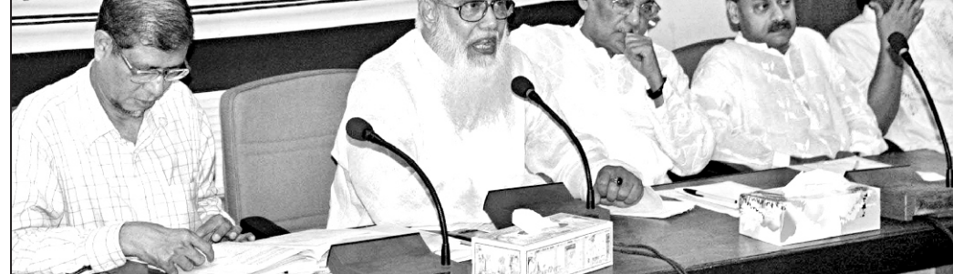
Justice Abdur Rouf speaks at a dialogue titled 'National dialogue: Evaluation and expectation of the civil society' organised by the Council for National Agenda (CNA) at the National Press Club in the city yesterday.