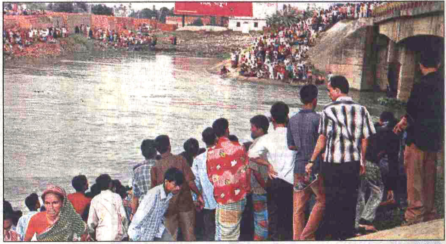
Locals and anxious relatives through the banks of the Bangshai near Shalepur Bridge after a bus with garment workers plunged into the river.