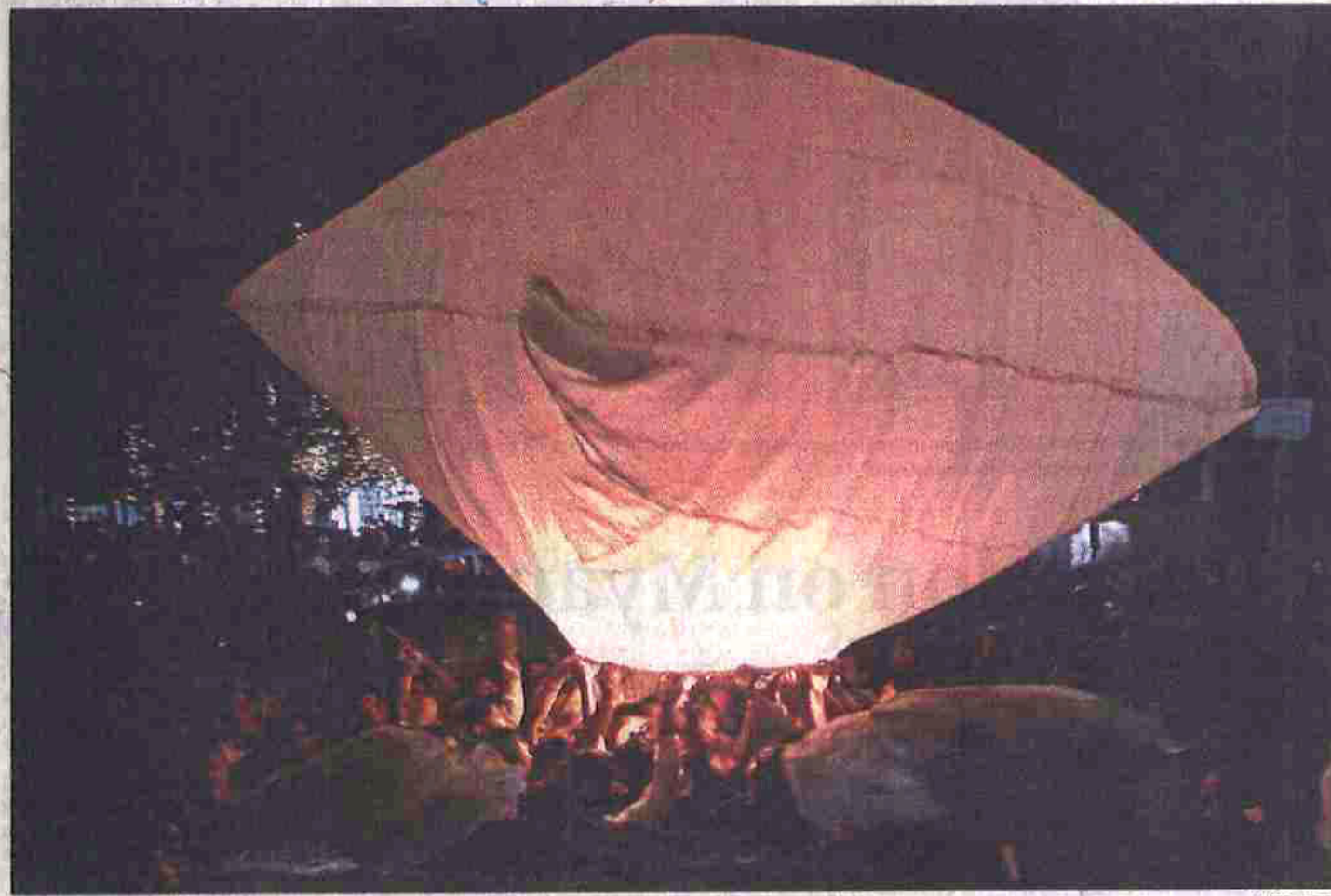
Buddhist devotees fly a hot-air balloon outside a shrine in Chittagong as the celebrate Probarana Purnima yesterday.