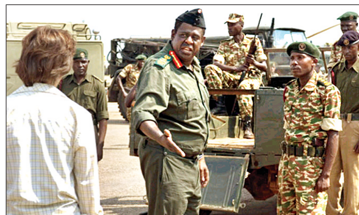
Forest Whitaker (C) in a scene from the film