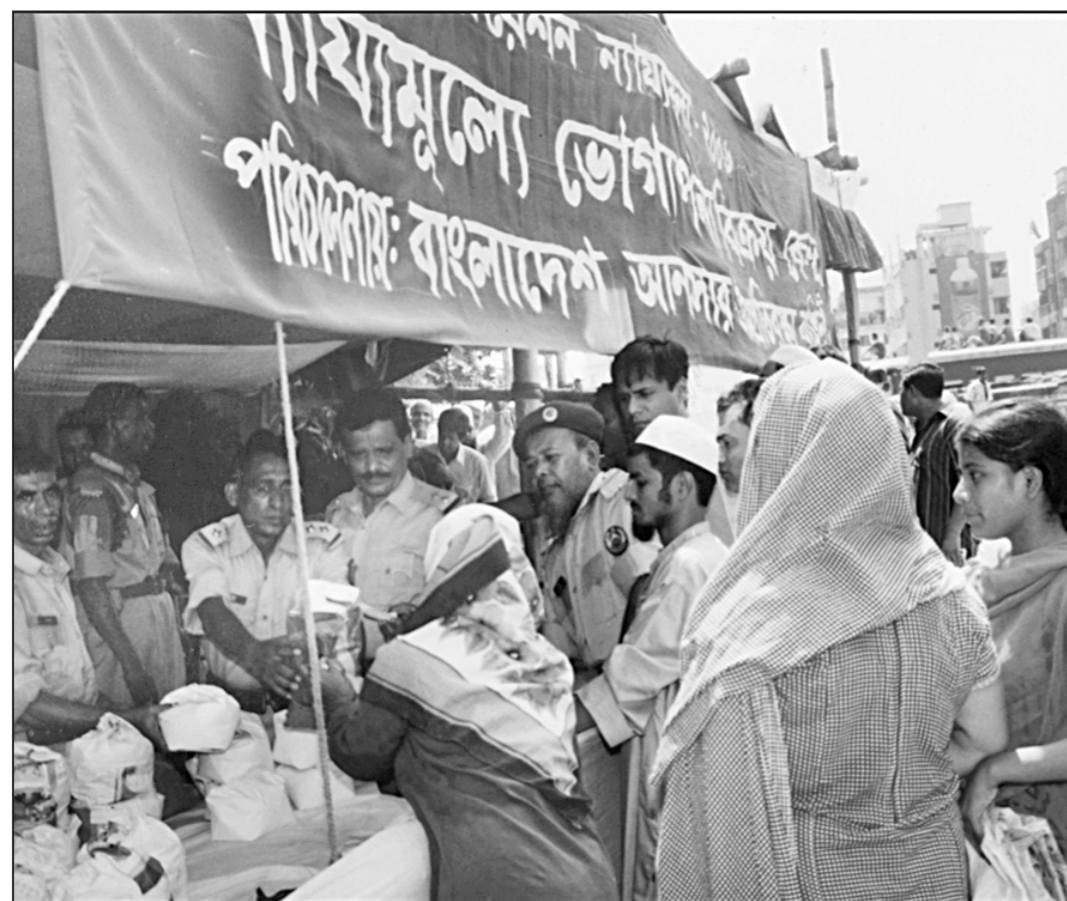
Members of Ansars and Village Defence Party sell essential commodities at fair prices at Khilgaon Chowdhurypara Community Centre in the city.

The Ansars and VDP have also taken a similar initiative for the people in Chittagong city.