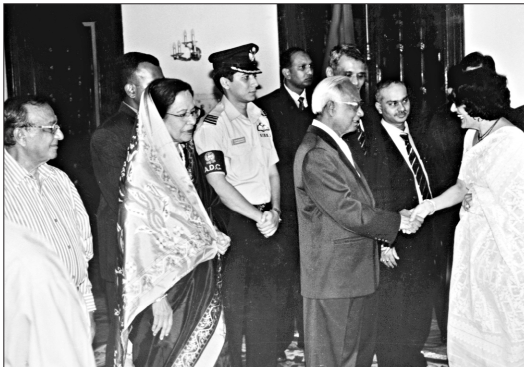
President Iajuddin Ahmed exchanges greetings with Indian High Commissioner Veena Sikri at a reception for members of the Hindu Community on the occasion of Durga Puja at Bangabhaban in the city yesterday.

The facilities already created in the Banskhali Eco-Park are no doubt could attract tourists. But lack of publicity about the facilities, narrow road, unavailability of secure accommodation and hygienic food and drink are the main hindrances to enjoy the natural beauty of the Eco-Park for the tourists.