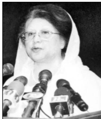
Prime Minister Khaleda Zia speaks at the inaugural ceremony of World Child Day and Child Rights Week 2006 at Osmani Memorial Hall in the city yesterday.

The PM said measures have been taken for appointment of an ombudsman to protect child rights.