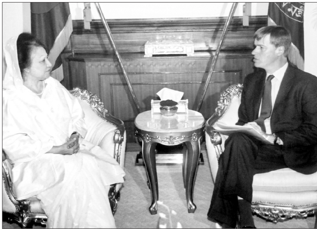
Chief Secretary to the Treasury of the UK Stephen Timms MP calls on Prime Minister Khaleda Zia at her office in the city yesterday.

"We expect this action of ours will create fresh inspiration in you in discharging the duties in a rejuvenated manner," she said.