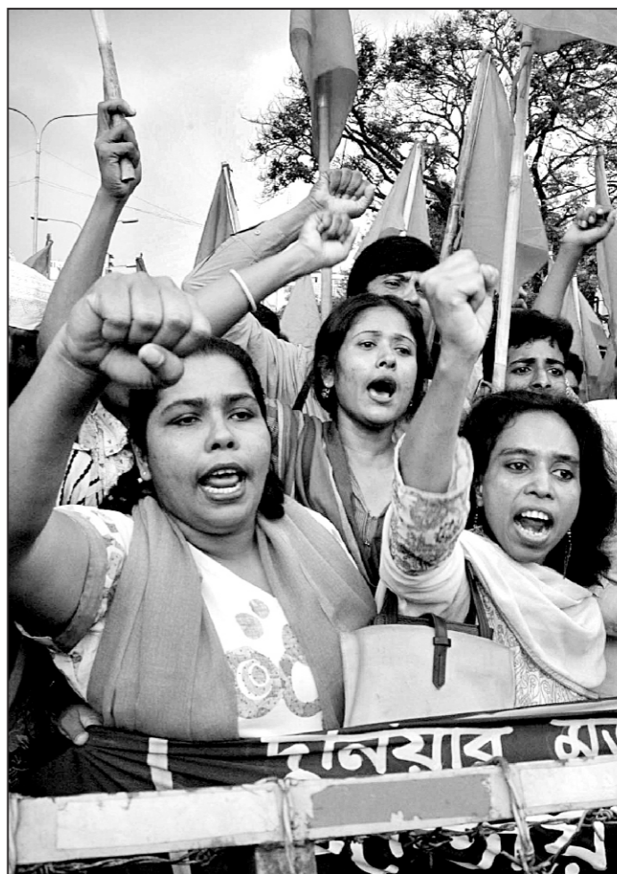
Police intercept a procession of RMG workers at Noor Hossain Square in the city yesterday that was heading towards Bangabhaban to submit a memorandum to the president urging him not to sign the new labour bill.

Police have strengthened their patrol in Doulatkhan Upazila where a tense situation has been prevailing.