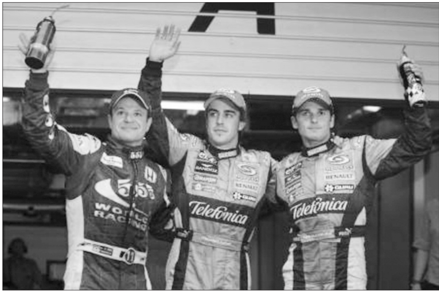
Renault's Fernando Alonso (C) and teammate Giancarlo Fisichella (R) celebrate their pole and second place standings for the Chinese Grand Prix alongside Honda's Rubens Barrichello.