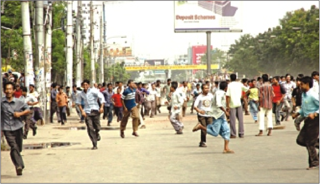
Garment workers clash with police at Uttara in the capital yesterday after the workers tried to barricade a road protesting assault on two of their colleagues allegedly by employees loyal to the factory owners.