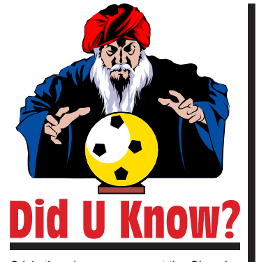
Cricket's only appearance at the Olympics was in 1900 where Great Britain defeated France by 158 runs.