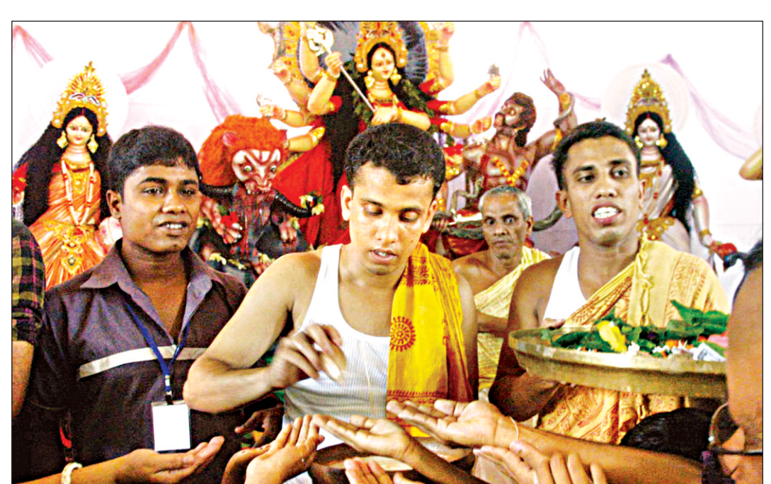
Devotees receive prasad from the priest at a puia mandap in Jagannath Hall of Dhaka University on Mahasaptami yesterday, the second day of the five-day Durga Puja celebrations.