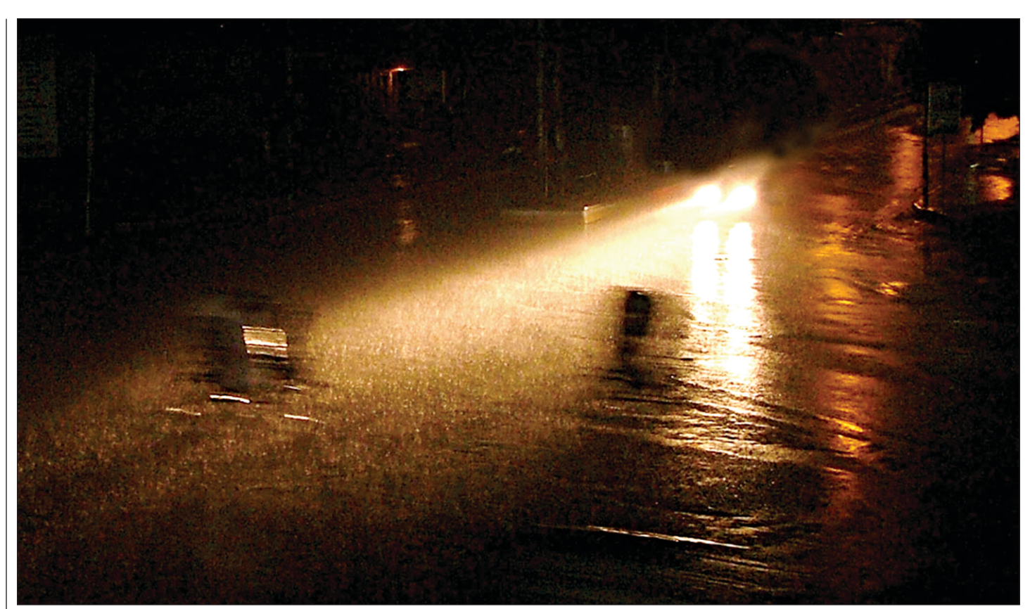
A car sees on its own the way through the darkened road near Kazir Deuri intersection in port city Chittagong while roadside lights are off due to load-shedding

Whoever their choice, the generals have reserved the right in SEE PAGE 15 COL 7