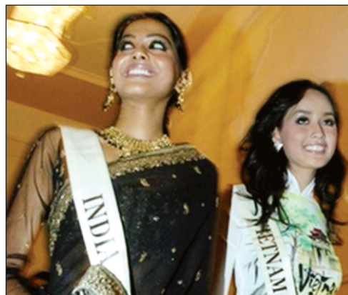
Grand Finale of the 56th Miss World On Star World at 12:00am Live from Warsaw, Poland

All programmes are in local time. The Daily Star will not be responsible for any change in the programme.