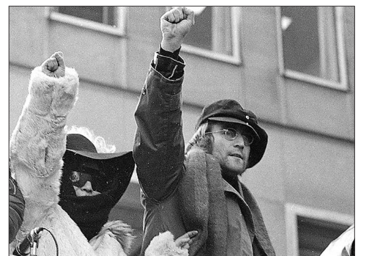
Yoko Ono (L) and John Lennon in a scene from the film