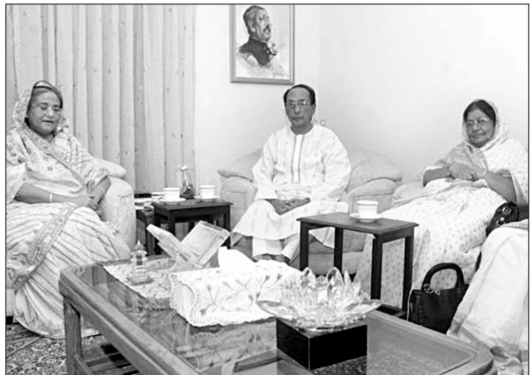
Amami League President Sheikh Hasina speaks at the AL presidium meeting at Sudha Sadan in the city yesterday.