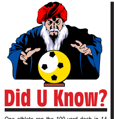
One athlete ran the 100-yard dash in 14 seconds, not a spectacular time, but he did it running backwards