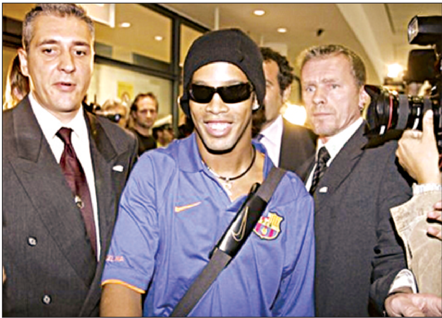
THE ICON ARRIVES: Barcelona star Ronaldinho (C) is all smiles upon his arrival at the airport in Bremen on Tuesday. Barcelona are to play Werder in the Champions League on Wednesday.