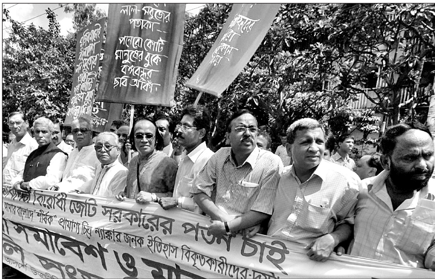
Bangalee Sangskriti Mancha forms a human chain at Muktangan in the city yesterday demanding ouster of the 4-party alliance government.