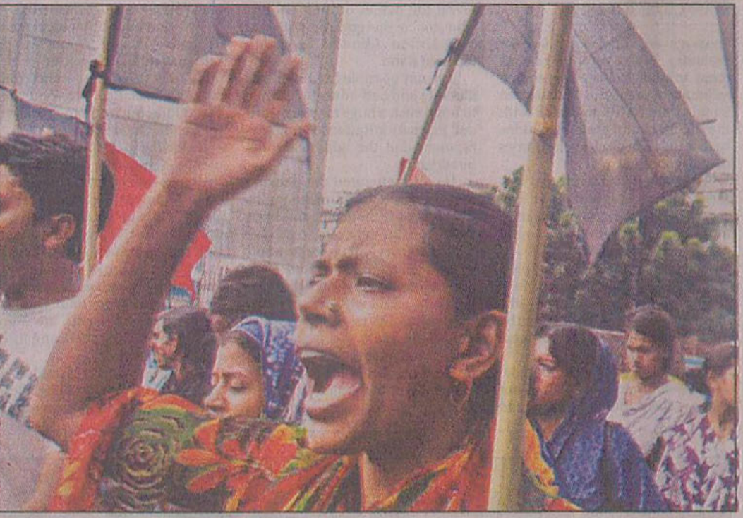
Jatiya Sramik Jote brings out a procession at Muktagong in the capital yesterday protesting against the new labour law passed in parliament on Monday.