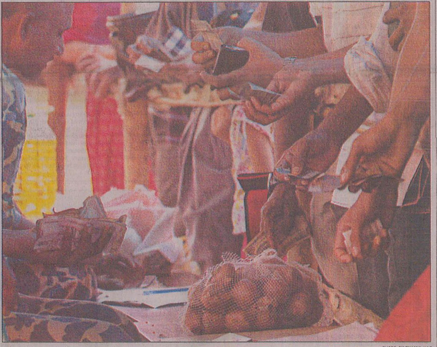
City dwellers through a Bangladesh Rifles-run 'fair price shop' beside Dhanmondi playground yesterday as the prices of essentials soar in the kitchen markets.