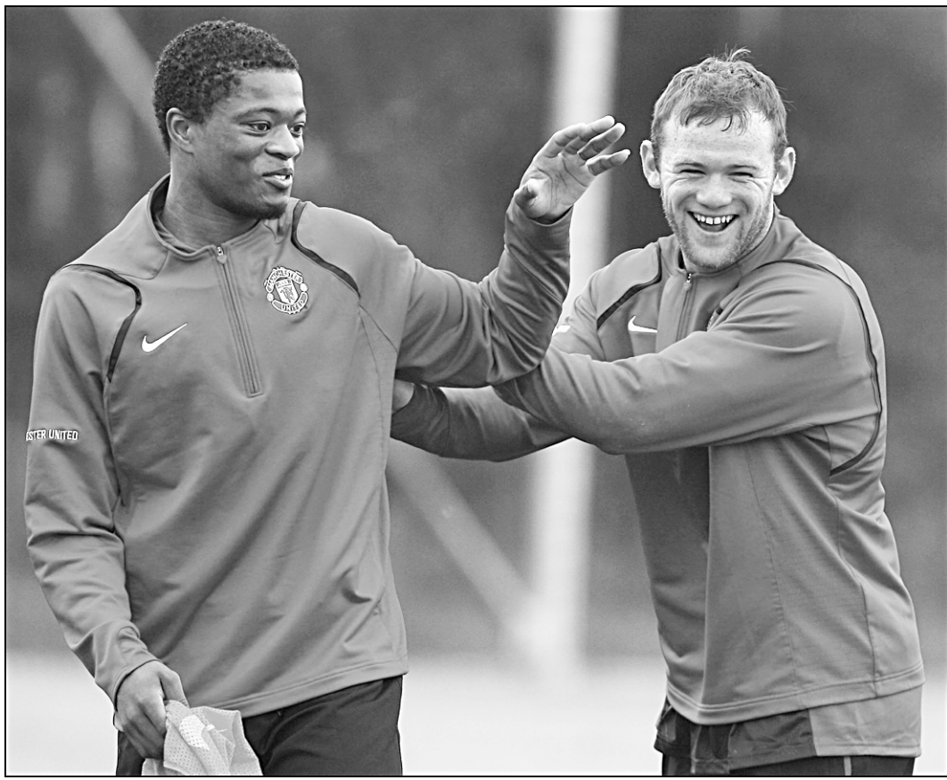
Manchester United teammates Patrice Evra (L) and Wayne Rooney joke during a training session at the Carrington ground in Manchester on Monday.

The Spanish side will now face Roma on Wednesday in the Champions League tie at the Mestalla Stadium, with both teams eyeing the top spot in Group D.