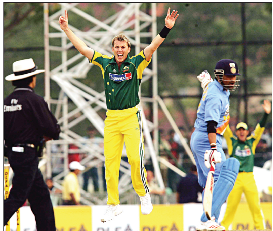
ON FIRE: Fast bowler Brett Lee (C) of Australia appeals unsuccessfully as India's ace batsman Sachin Tendulkar refuses a single during their DLF Cup series match at the Kinrara Oval in Kuala Lumpur on Friday.

Result: Australia won by 18 runs. Man-of-the-match: Brett Lee.