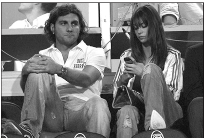
Atalanta forward Christian Vieri (L) watches his team's proceedings in their match against Empoli alongside girlfriend Melissa Satta in Bergamo on Wednesday.

"What I want to do is leave a permanent mark on Manchester, leave my mark on the club as the first Portuguese who played there, to leave the door open for others, my colleagues, to go there to play one day."