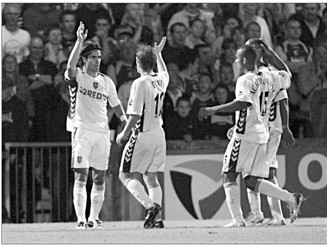
Aston Villa marksman Juan Pablo Angel (L) celebrates his strike against Scunthorpe United during their Carling Cup clash in Scunthorpe on Wednesday.