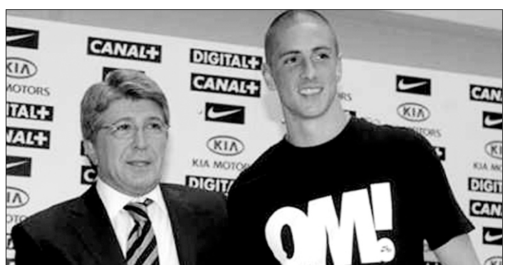
FERNANDO TORRES (R)

After a disappointing 10th-place finish last year Atletico have spent about 50 million euros reinforcing their squad and after three games are seventh in the new league campaign.