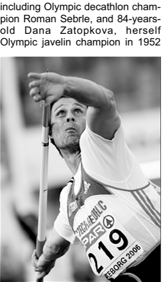
JAN ZELEZNY and also the widow of legend and four-time Olympic champion Emil Zatoppek also watched his final throw. "Honza (Zelezny) has had a wonderful career. I give him all the congratulations I can for that," said

Zatopkova. Zelezny had an extraordinary career winning 148 of the 246 events he competed in and collected his last major medal (he won 11 in all) with bronze in the European championships -- a title he never surprisingly won. "Even yesterday (Monday) I felt nostalgic but today it is okay," said Zelezny, who was four-times Czech sportsman of the year and seven times voted their best athlete of the year. A member of the International Olympic Committee (IOC) Zelezny is set to devote the rest of his career to coaching and is undertaking a training course in Prague. However the former army officer is confident that even with his retirement Czech athletics has a bright future. "Young athletes must have a target," he said. "There are several young athletes who can one day win medals. Barbora Spotakova (silver medallist in the javelin at the recent European Championships) is excellent and will win a lot of medals."