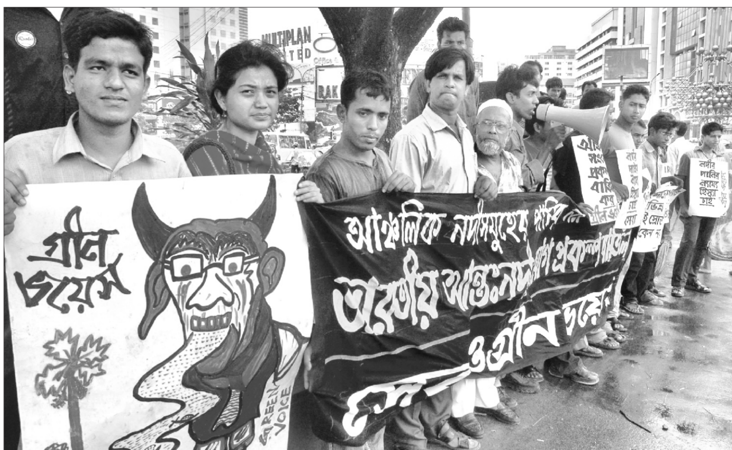
Seba and Green Voice form a human chain at Panthapath in the city yesterday demanding cancellation of India's river link project.

The rail communication at Kamalapur-Bahadurabad Ghat rail line resumed again at 10:30am.