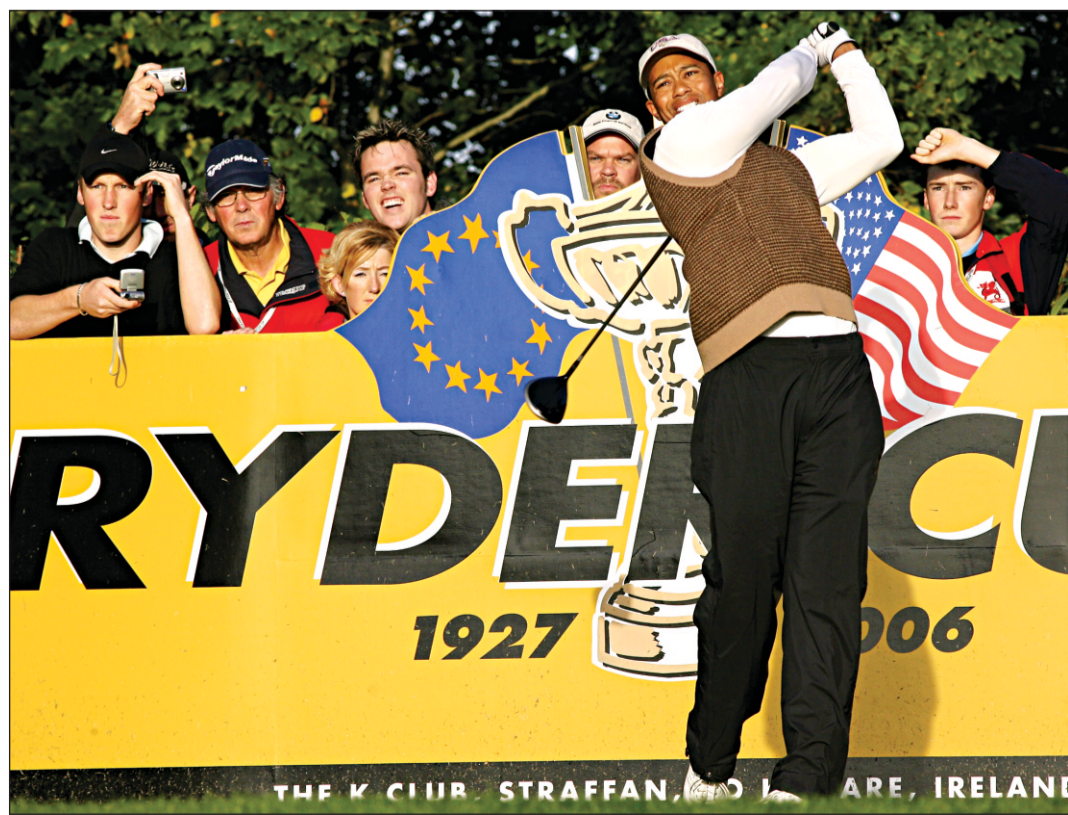
Tiger Woods of the United States Ryder Cup Golf Team tees off on the fourth hole during the first practice day for the Ryder Cup in the Republic of Ireland on Tuesday.