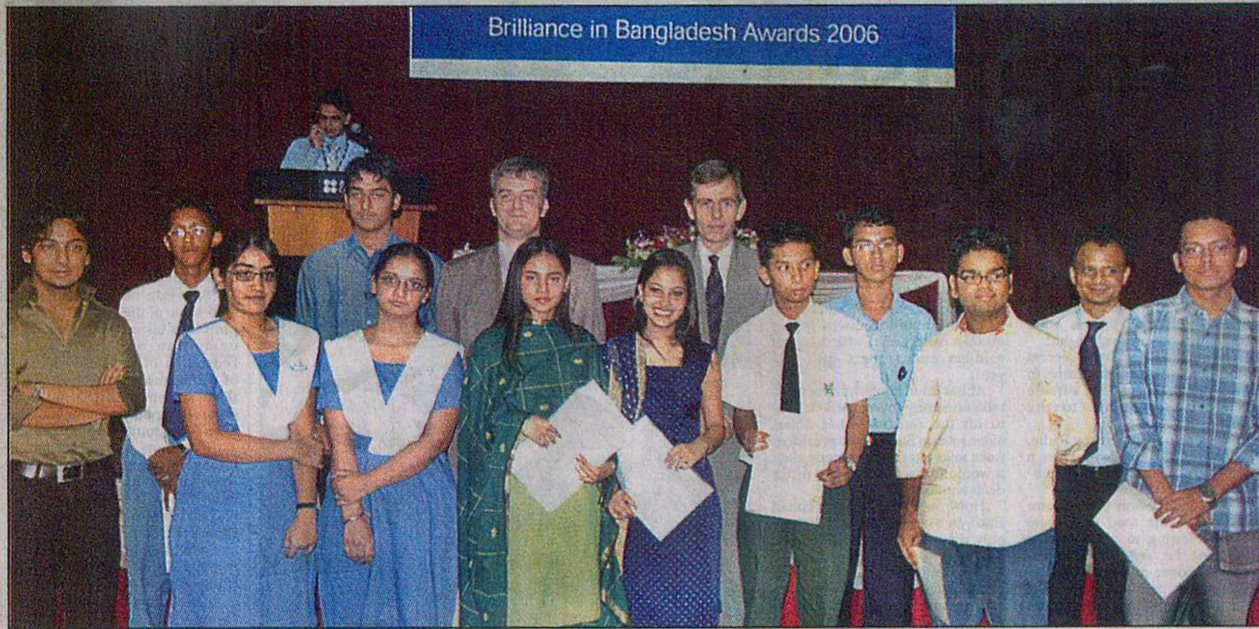
Brilliance in Bangladesh Awards 2006